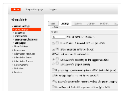
mock-allow-checkout-witho 25 minutes ago 88 kB