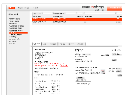
mock-admin-hint-no-VAT-II 8 minutes ago 137 kB